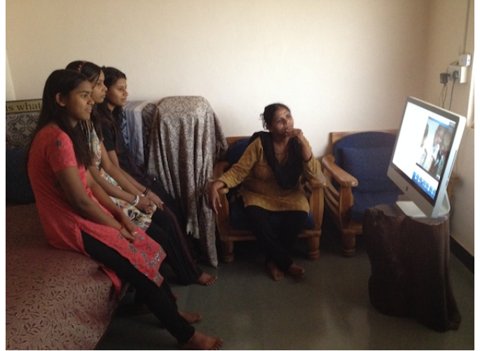
Skype Call with Students in Singapore

For the third year in a row, all three of our eligible students passed their 10th standard, which is one of the important milestones in their education.